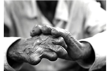
Compassion for the Untouchable