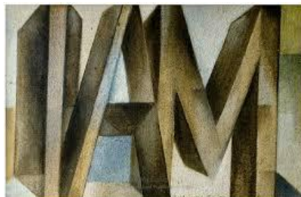
I Am, 1954